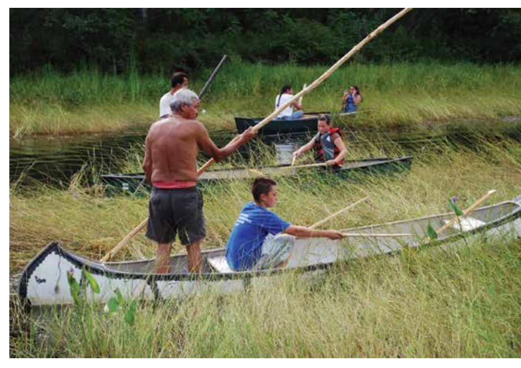
Figure 2. Bad River elders teach tribal youth how to harvest wild rice.

There is place-based evidence that lake habitats may be changing. "A