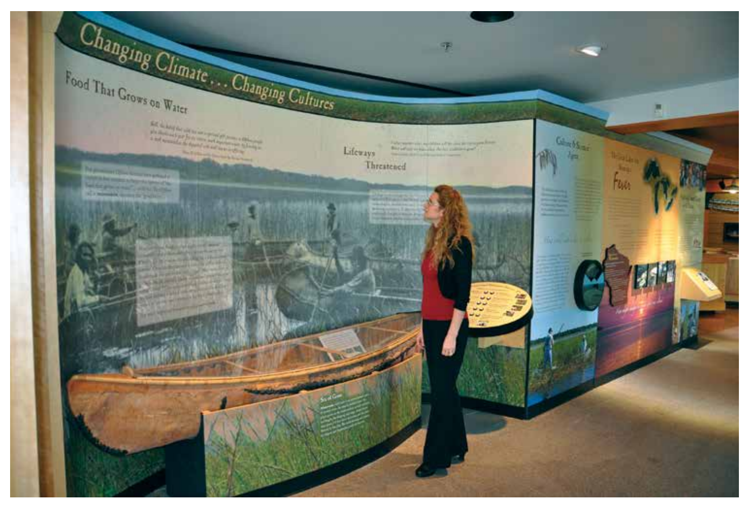
Figure 4. The G-WOW Discovery Center promotes hands on investigation of cultural and scientific evidence of climate change, while encouraging action to mitigate its impacts.

parks are near the top of most peoples' lists. The G-WOW model works and I hope we can export it to other national parks and protected lands. The seamless partnership is also a big part of both the success and the satisfaction."